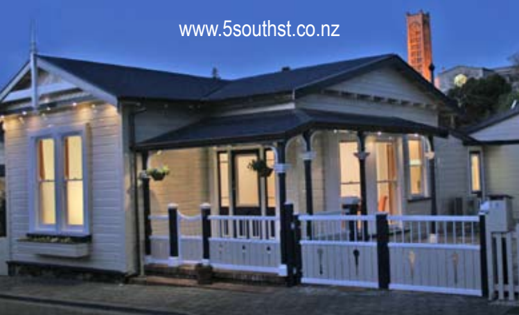
Bermudiana Cottage No. 5 South Street Nelson 7010 New Zealand